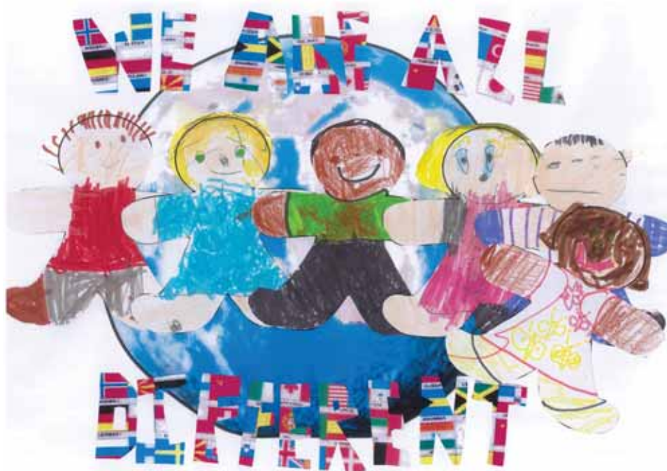
“Different Faiths Living and Working Together” by York Class at St Andrews