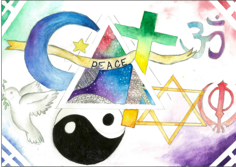
“Different Faiths Living and Working Together” by Suejla