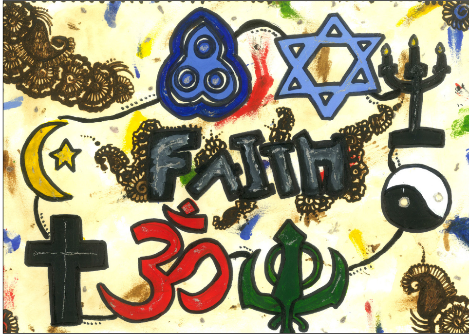
“Different Faiths Living and Working Together” by Tooba