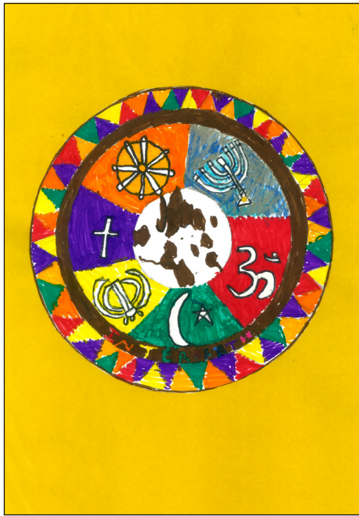
“Different Faiths Living and Working Together” by Afrah