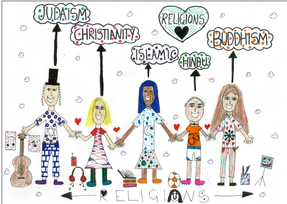
"Different Faiths Living and Working Together" by Libby